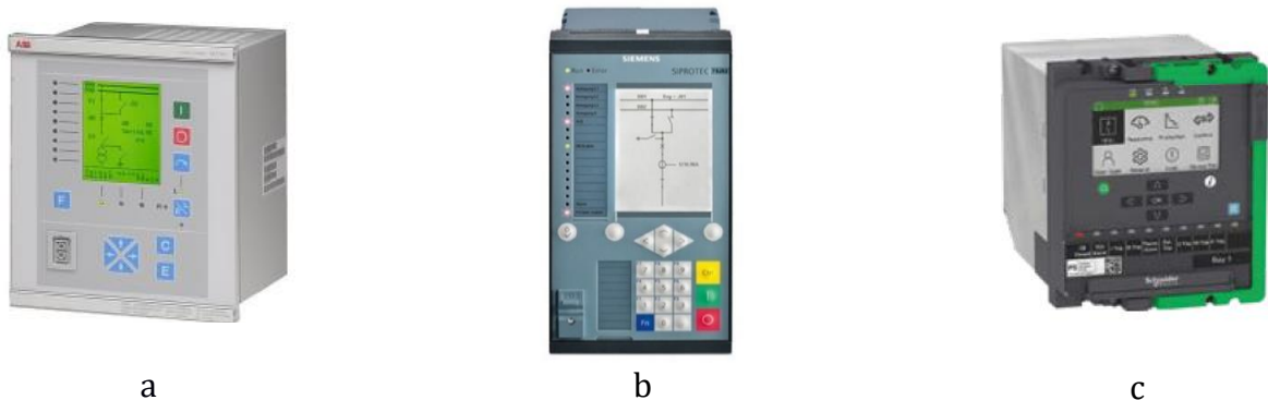
Fig. 3. Appearance of microprocessor terminals for relay protection and automation from leading European manufacturers: